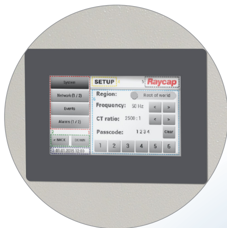
Rayvoss AD Protection Monitoring