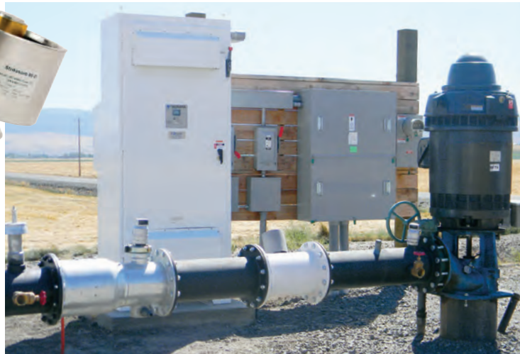
125 hp Drive Using Strikesorb 40 Modules