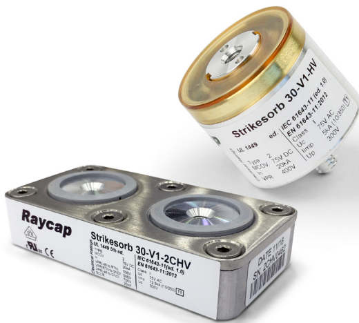
Figure 4. Two of the Strikesorb SPDs from Raycap

For example, Raycap's Strikesorb technology is a unique OVP solution that includes both Class I and Class II protection. Strikesorb products incorporate a distribution grade metal oxide varistor (MOV) to handle larger surges without affecting performance. The voltage level applied to the equipment during a surge event (let-through voltage) needs to be low and as close as possible to the nominal operating voltage level; Strikesorb has very low let-through voltage characteristics.