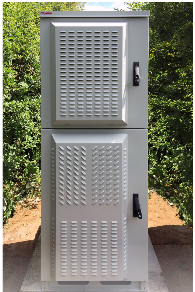
Figure 4. Raycap Telecom Cabinet housing active components

Raycap has been building cabinets for a long time; we've put a lot of thought into them. We have a wide range of standard products, from fiber demarcation kits to pole-mounted shrouds and power protection cabinets that combine the main disconnect switch, manual transfer switch, load center, surge protection and other integral components into compact or large enclosures. We manufacture our cabinets to be durable; our products are typically aluminum with insulation, or steel.