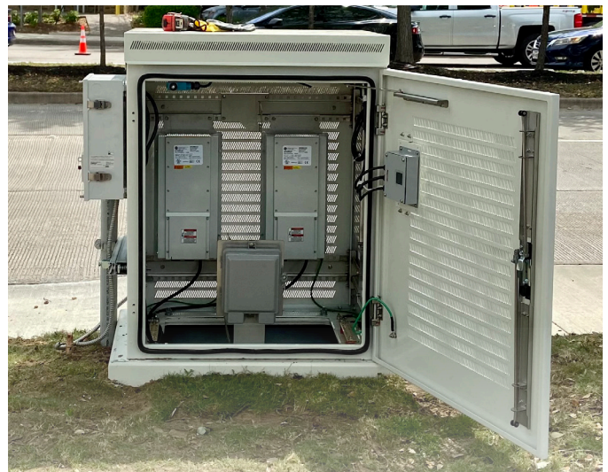
Figure 2. Ground Cabinet Enclosure

Climate change complicates this choice. Network operators can't afford to assume that current environmental conditions will be the same in the coming years. In addition to producing extreme weather conditions, climate change is increasing the frequency and severity of lightning strikes in places where lightning is already common. It is also increasing the likelihood of lightning in places where it was once rare. Natural disasters aside, grid power has always been prone to fluctuate.