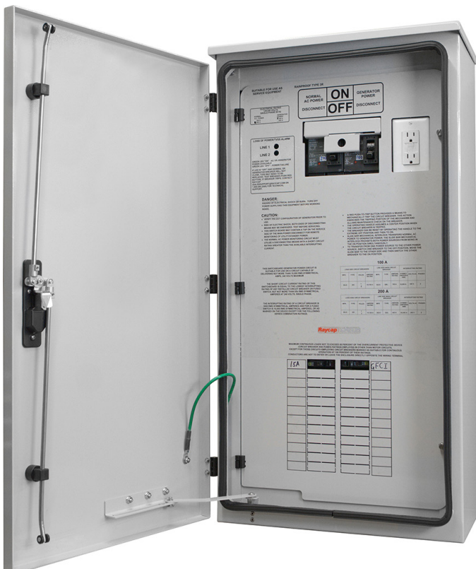
Figure 3. Compact Power Protection Cabinet (PPC)

To mitigate against both problems, network operators can consider incorporating advanced surge protection technology directly into their cabinets.