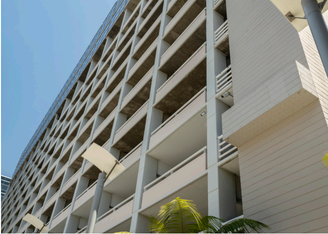
Figure 1. Concealment featuring InvisiWave; El Segundo, CA.

The auction for C-band spectrum was held in 2021. Since then, carriers have continued to install small cell poles, but also shifted 5G rollout to upgrading existing macro cells (such as towers) by adding C-band equipment. The combination gives carriers the option to provide the fastest possible 5G download transmission rates using mmWave spectrum, and to extend physical coverage with C-band equipment.