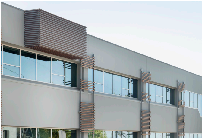
Figure 2. Custom concealment to match building's architectural elements; Hermosa Beach, CA.

In LA, as in many other markets, some regulations dictate the appearance, form, and function of poles and other cell sites. Many of these regulations pertain not only to new poles but also to pole modifications. Since Raycap already went through LA's approval process in the initial wave of 5G deployments, the company is well-positioned to provide small-cell poles in the area, and its poles are found in several locations. Raycap is also in the rare position of owning its own manufacturing facilities on both the east and west coasts; the company can build and deliver its products quickly and efficiently.