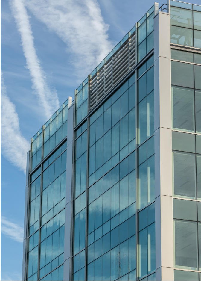
Figure 4. Architectural louvers add visual interest and blend in with the building while concealing telecommunications equipment.

With engineering, concealment, connectivity, and unsurpassed overvoltage protection, Raycap continues to support its carrier customers with solutions for the rollout of next generation networks.