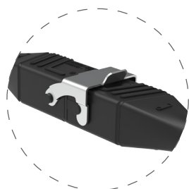
Safety lock for connecting.