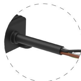
Version without connectors (optional).