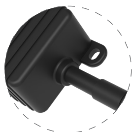
Different mounting options: screw, glue or zip tie directly in the shades box.